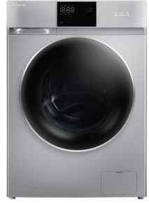
• Silver • White