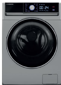
• Silver • White