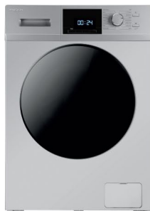
• Silver • White