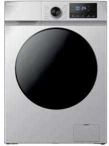
• Silver • White