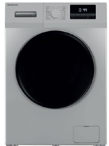
• Silver • White